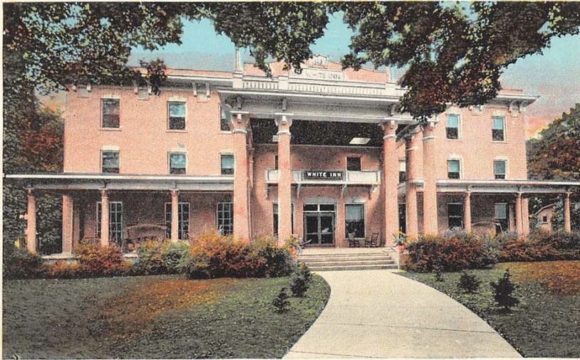
"WHITE INN," FREDONIA, N. Y.

F redonia is a small village located in the Town of Pomfret settled in Chautauqua County, New York.